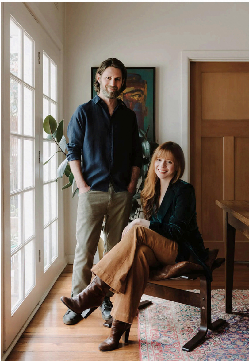
From The Design Files' feature on our hills home.