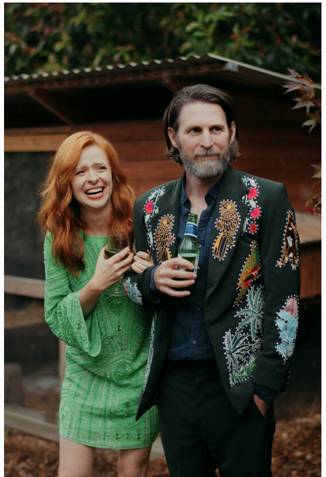
From our 10 year anniversary party at our place.