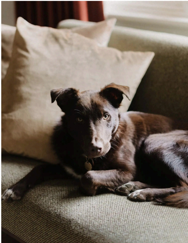
Our beautiful Taika.